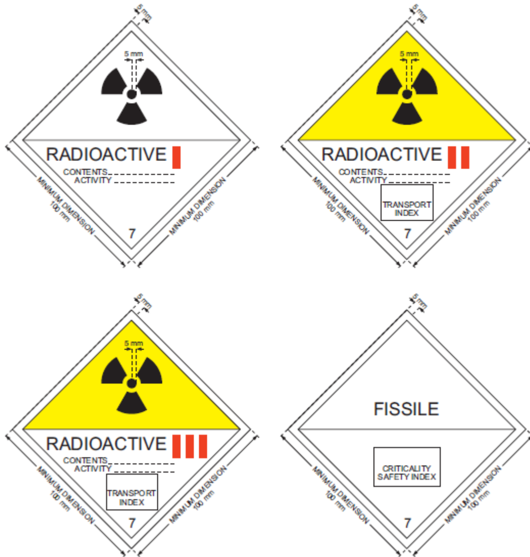
FIG. 2. Labels used on radioactive material packages and fissile material labels that can be added as appropriate.

I.37. The different types of labels indicate the relative radiation hazard outside the package. The maximum possible dose rates for each type of label are indicated in Table 1. Additionally, the label is required to display the names of the radionuclides and the total activity of the radionuclides in the package. For categories II-YELLOW and III-YELLOW, the labels will indicate the transport index (TI). The TI is a number used to provide control over radiation exposure and is an indicator of the dose rate at 1 metre from the external surface of the package.